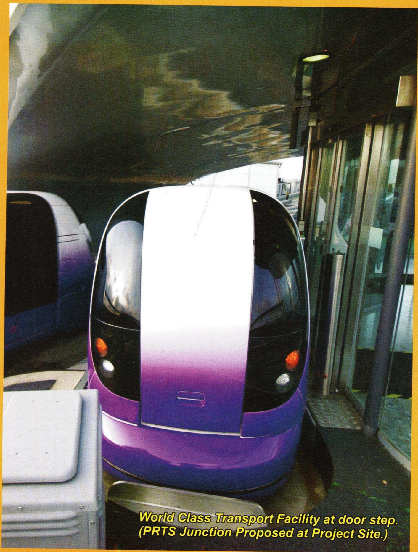
World Class Transport Facility at door step. (PRTS Junction Proposed at Project Site.)