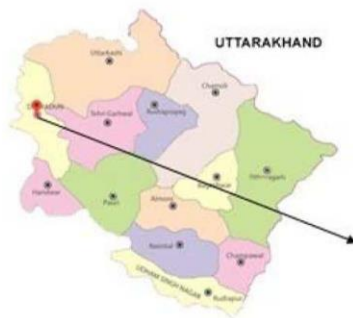
Rajpur Park , Dehradun ,Uttarakhand

In the hinterlands of Dehradun , Uttarakhand lies the Rajpur Park peacefully snuggled in the Kairwaan village at Rajpur. It falls under the Garhwal region . This lavish park is thronged by many visitors belonging to different age groups who are enticed by the park's well-manicured gardens and scenic beauty around.