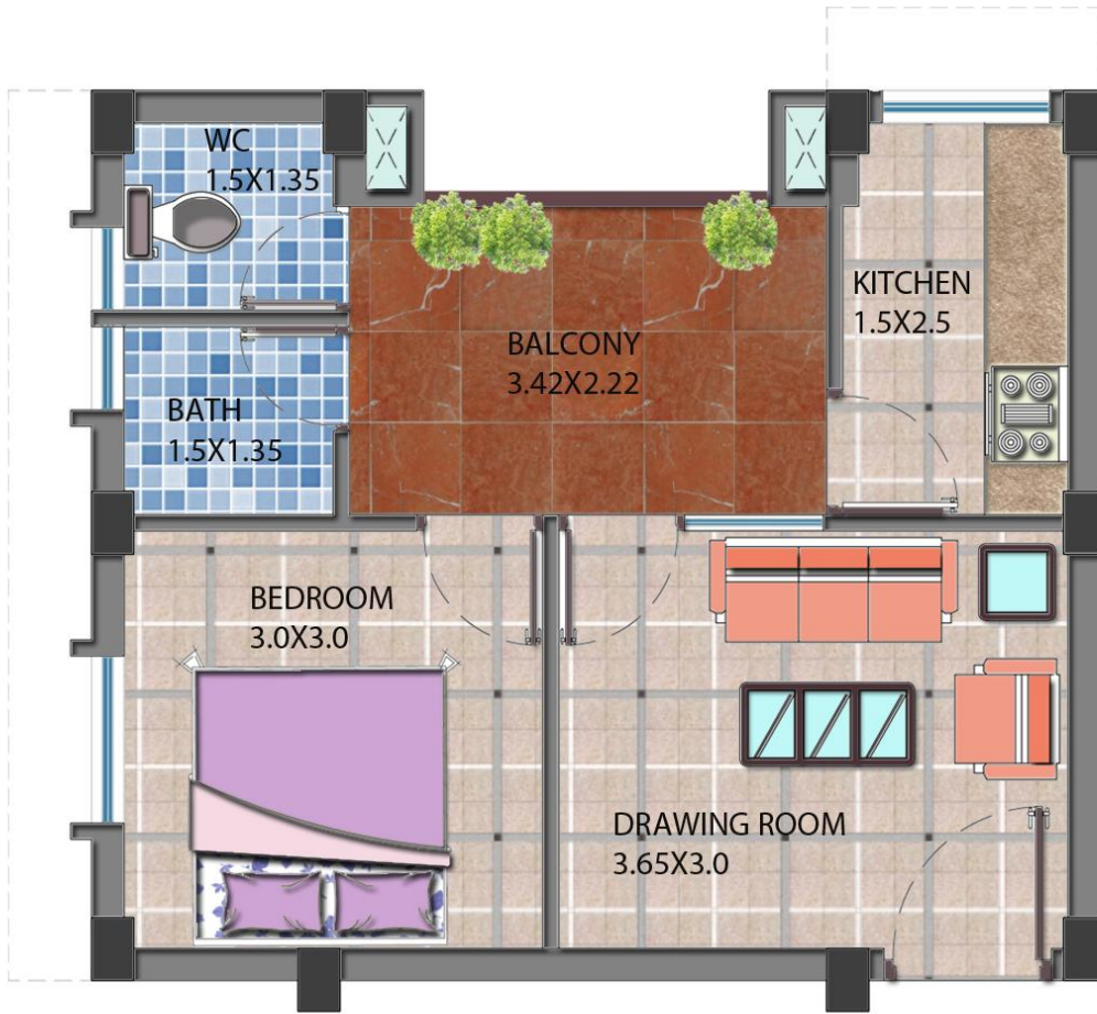
LIG Unit Plan